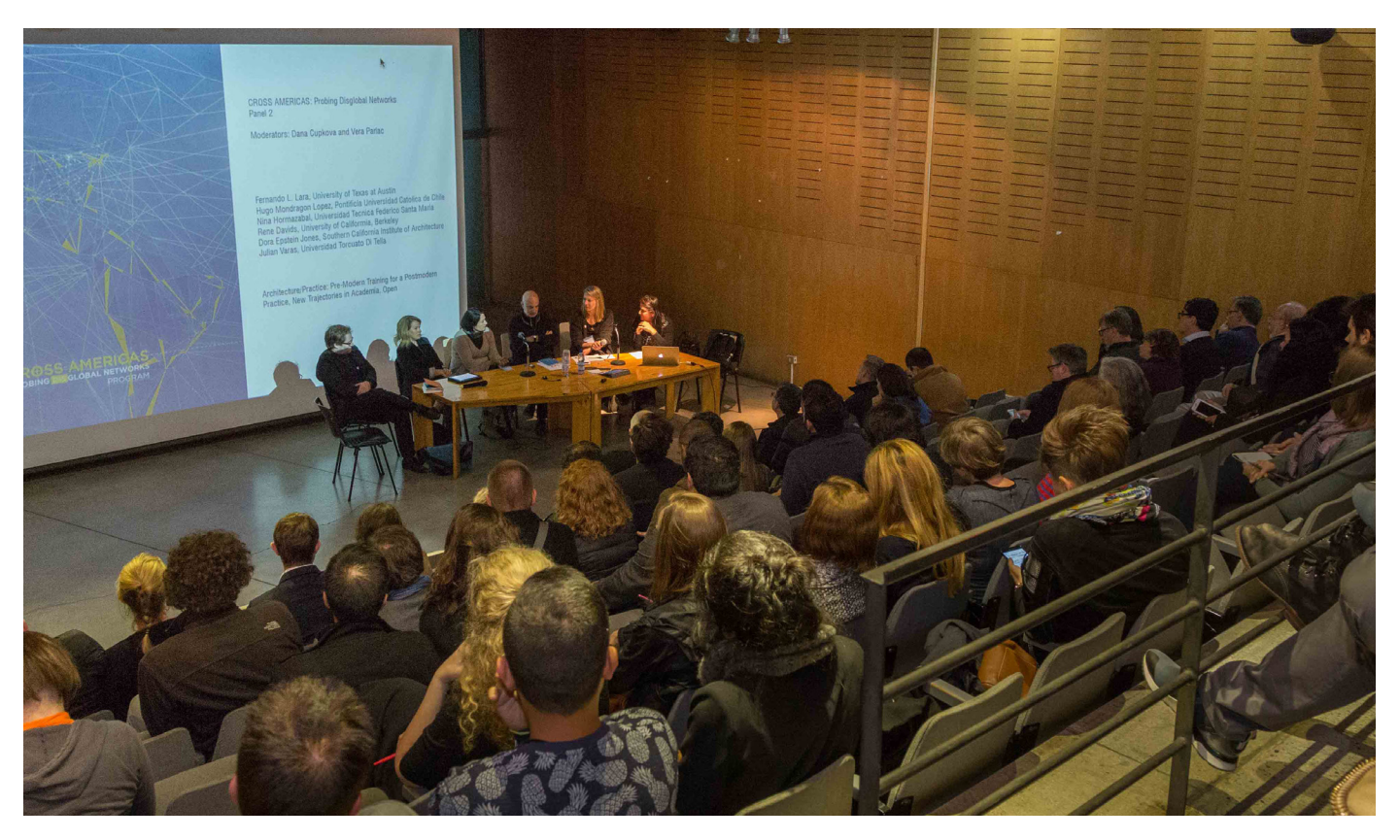
Figure 1: Opening panel session with co-chairs.